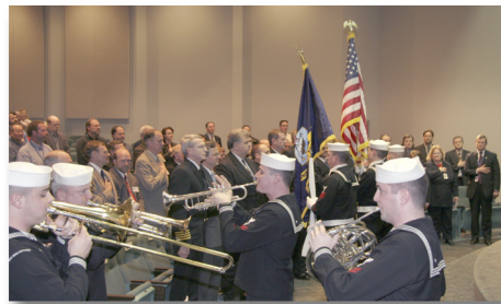
The Team Torpedo Celebration kicks off with the posting of the colors and the U.S. Navy Band playing the national anthem.

Torpedo was tasked with creating a new generation of lightweight/heavyweight torpedoes — the MK54 and MK48 — that would be better and less costly than their predecessors. The team announced success in its goal when Raytheon was awarded a